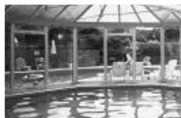
Waves Health & Leisure

We are happy to assist you with the administrative planning of your event. We can correspond directly with your lodge members, send invitations and assist them with their accommodation bookings as required. This service is provided free of charge.