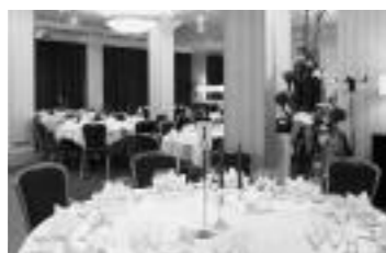
Menzies East Cliff Court