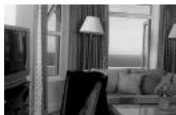
Menzies East Cliff Court